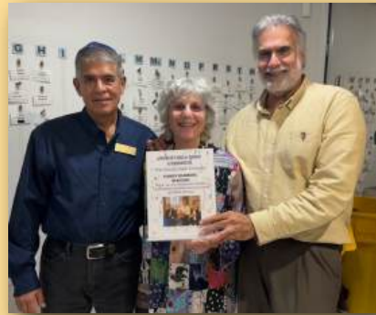
Celebrating our Musicians and Birthdays